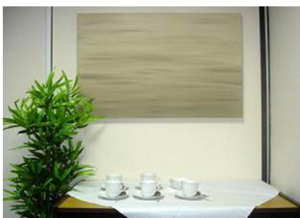
Artsorption Absorption Coefficient