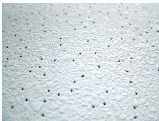
Detail of perforation

The tiles are produced from bio-degradable mineral wool, inorganic fillers and binders and finished with 2 coats of a dispersion type paint which is free from organic solvents.